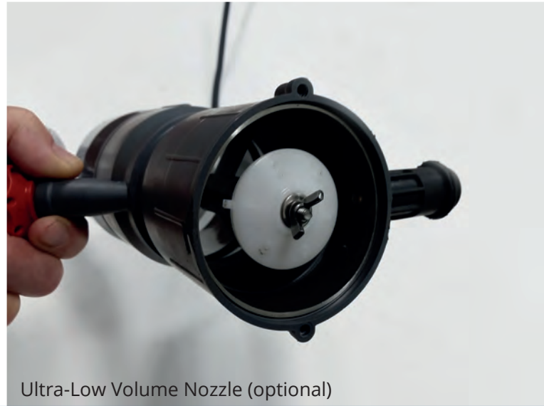
Ultra-Low Volume Nozzle (optional)